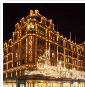
Harrods Luxury Department Store